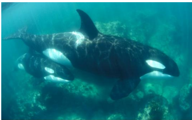
MIRACLE with MAGIC in 2001.

OTHER COMMENTS: It was three years before Miracle was resighted after her rescue. She stranded when she was just a teenager, and in 2001 had her first calf (Magic). In 2009 she had her second calf (Merlin). Miracle often approaches boats and her first calf, Magic, has learnt this behaviour.