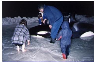
MIRACLE ON THE BEACH.

MOST RECENT RESIGHTING: Whangarei Hbr (North Island)