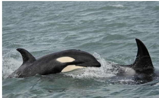
MIRACLE WITH MERLIN in 2009.