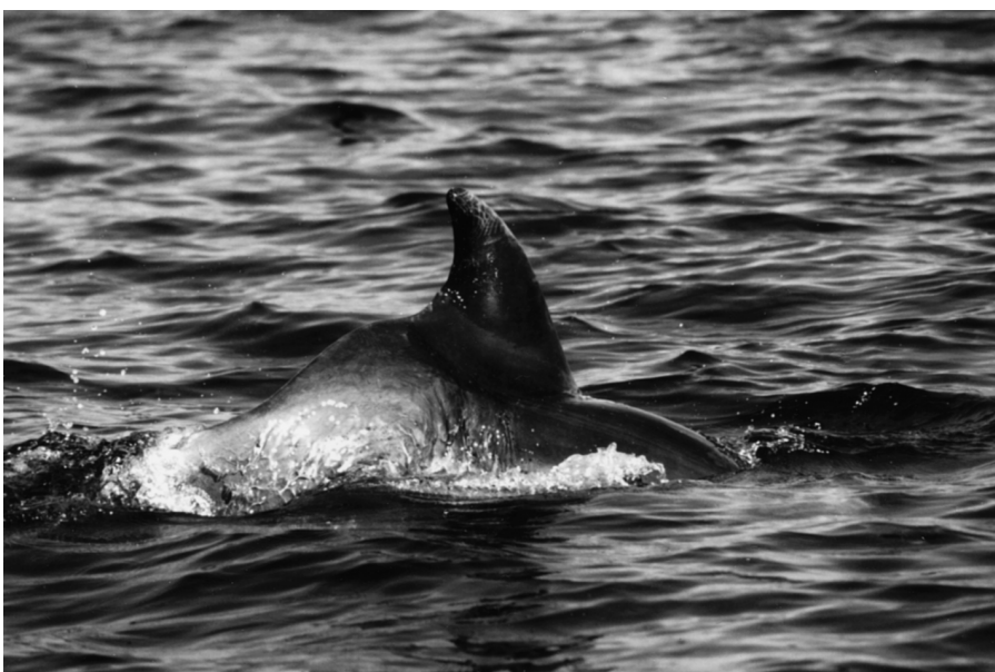
Figure 2. Quasi (case no. 1), a bottlenose dolphin with kyphoscoliosis (lateral view), photographed in the Bay of Islands, NZ.

kyphoscoliosis, observed in the Bay of Islands (35°14'S 174°08'E) from January 1994 to July 1997. A lateral sigmoid curve, concave to the left, was apparent from directly caudal to the dorsal fin to the peduncle, with a deviation of approximately 30 degrees to the right then approximately 30 degrees