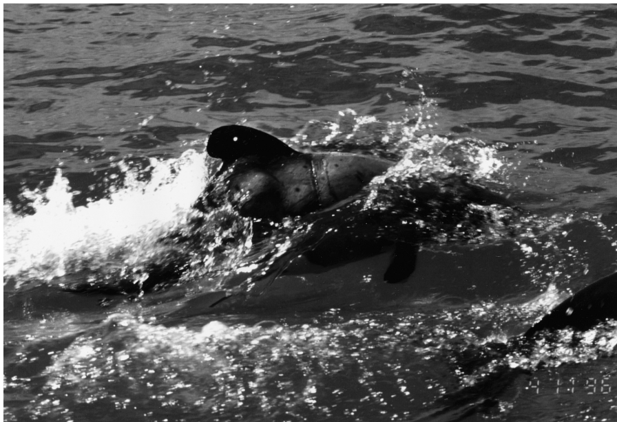
Figure 5. Spaghetti (case no. 9), a Hector's dolphin calf with scoliosis, photographed near Kaikoura, NZ.

column, deviating to the right then back to the left, was apparent caudal to the dorsal fin. A protrusion was visible on the right lateral surface, slightly caudal to the dorsal fin. The dorsal fin leaned