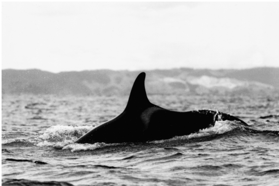
Figure 4. Marilyn (case no. 7), a killer whale with slight lordosis, photographed in the Bay of Islands, NZ.