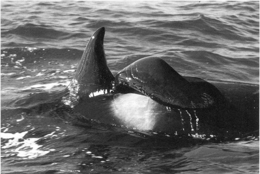
Figure 4. Dorsal fin of killer whale NZ101 where the posterior portion has collapsed on 15 October 1999 (day 365). Open edges of wound are healed over and are dark like rest of the skin on the dorsal fin. The white scar is still visible.