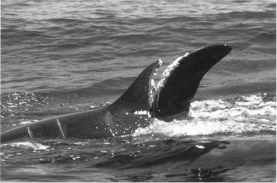
Figure 3. Cut in the deteriorating dorsal fin of killer whale NZ101 (day 27), with exuberant granulated tissue visible. The white scar below the dorsal fin remained from a large blister the whale received while stranded, shallow scars anterior to the dorsal fin are visible.