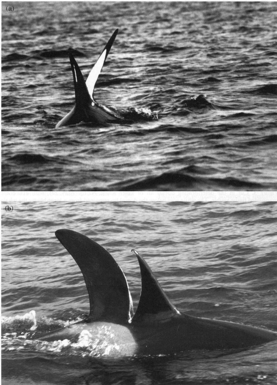
Figure 2. Split dorsal fin of killer whale NZ101 presumed to be caused by a boat strike on 16 October 1998 (first sighting after boat strike).

'sluggish' and was trailing behind the other killer whales present.